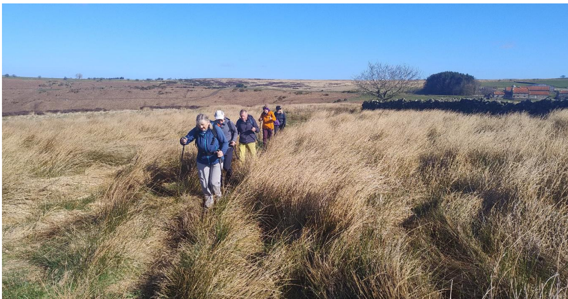
Near Whitestones.