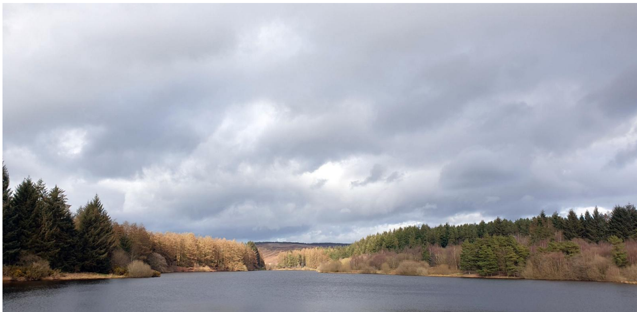
Cawbeck Reservoir